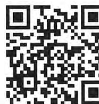
QR code to access online nomination form.